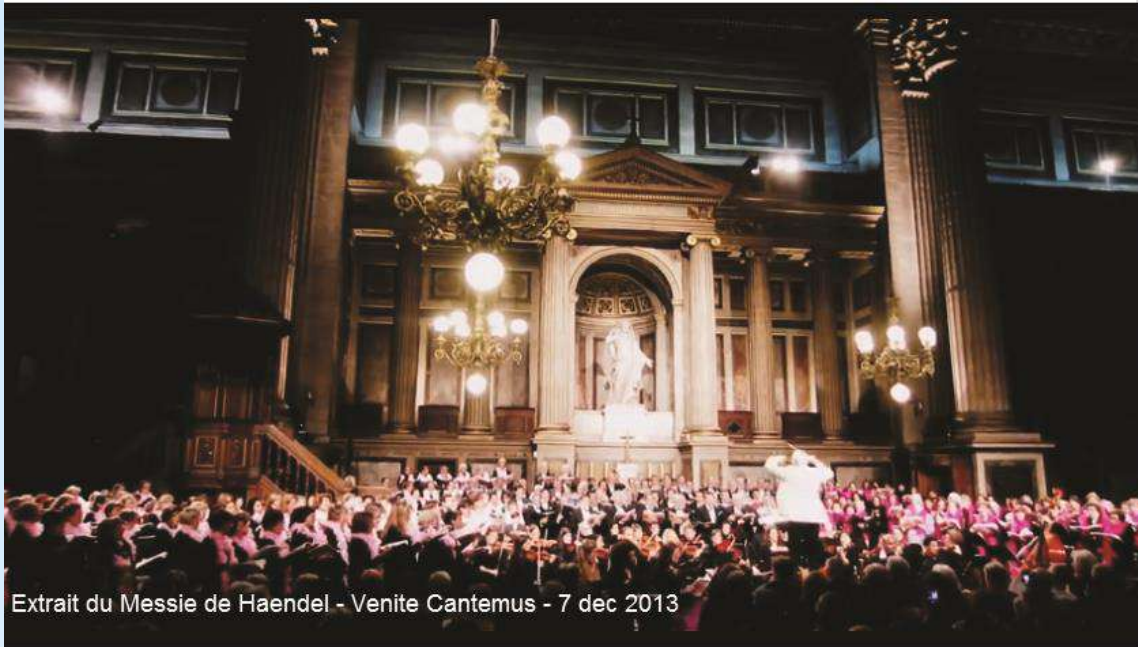
Extrait du Messie de Haendel - Venite Cantemus - 7 dec 2013