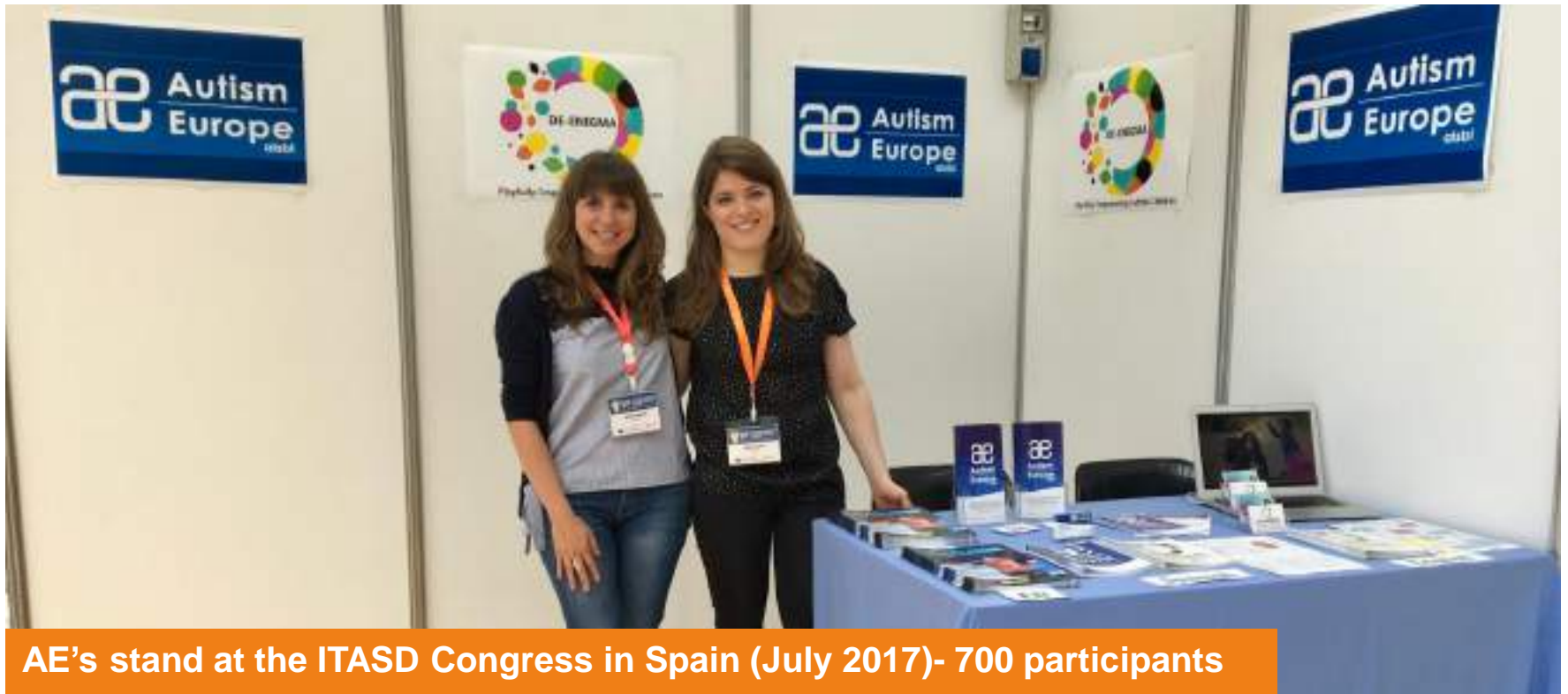
AE's stand at the ITASD Congress in Spain (July 2017)- 700 participants