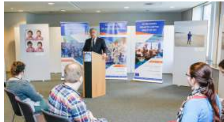
Photo exhibition “Beak Barriers Together for Autism” in the European Parliament (from April 9 th to April 13 th )

18 testimonies from 16 European countries