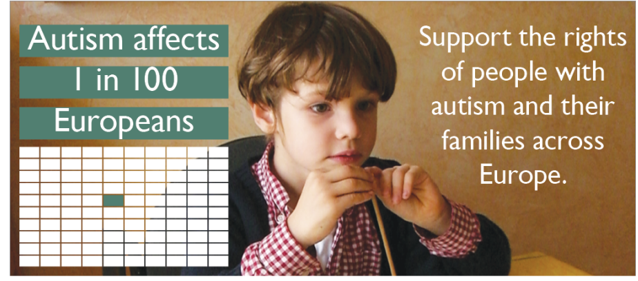
Sign the WRITTEN DECLARATION ON AUTISM 0018/2015 for a European Strategy on Autism that will:

The document calls on the European Union and its Member States to adopt a European strategy for Autism .