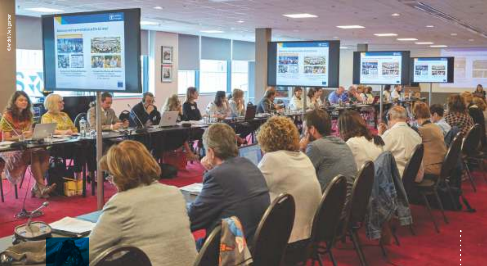
Overview of the General Assembly meeting.