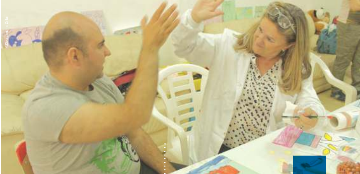
Art workshop set up at the Diversamente Onlus office