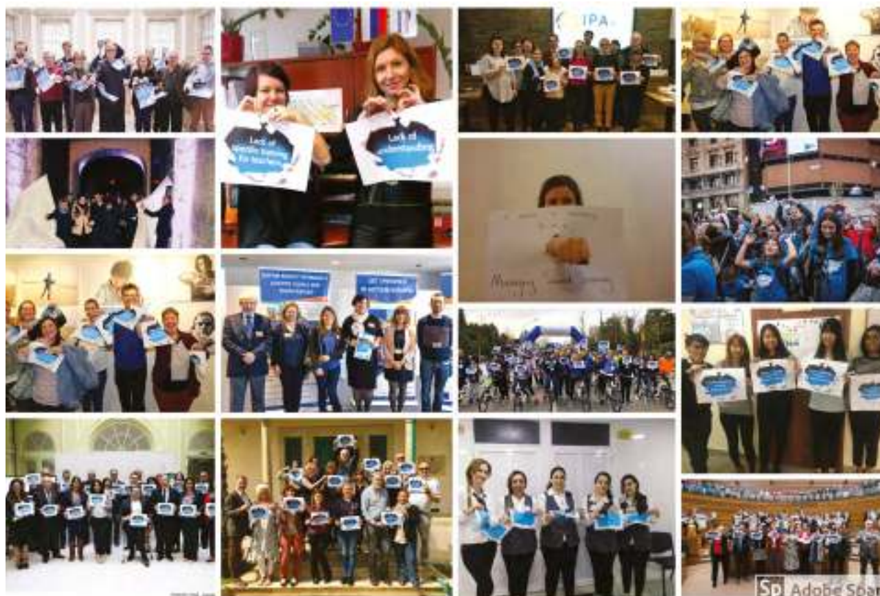
Collage of pictures taken in 12 different countries in 2018. The collage features supporters from Portugal, Slovenia, Serbia, Spain, France, Luxembourg, Malta, Hungary, Belgium, Italy, the UK, Syria, Iran, Russia, FYR of Macedonia, Cyprus and Croatia.

The pictures on display were taken by three photographers from the UK (Graham Miller), Poland (Michał Awin) and Luxembourg (André Weisgerber), all aiming to help people understand what accessibility means for those on the autism spectrum and what kind of obstacles they face in their everyday lives. The exhibition was made possible thanks to the support of Photohonesty, and AE members the JiM Foundation and Fondation Autisme Luxembourg .