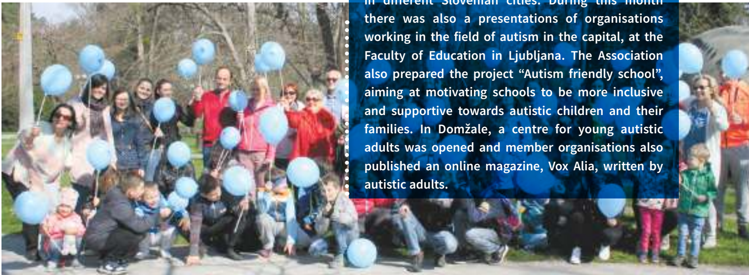
Last April, the Association organised an autism awareness campaign, including a walk with balloons in different Slovenian cities.

In April 2018, the Association organised an autism awareness campaign, including a walk with balloons in different Slovenian cities. During this month there was also a presentations of organisations working in the field of autism in the capital, at the Faculty of Education in Ljubljana. The Association also prepared the project “Autism friendly school”, aiming at motivating schools to be more inclusive and supportive towards autistic children and their families. In Domžale, a centre for young autistic adults was opened and member organisations also published an online magazine, Vox Alia, written by autistic adults.