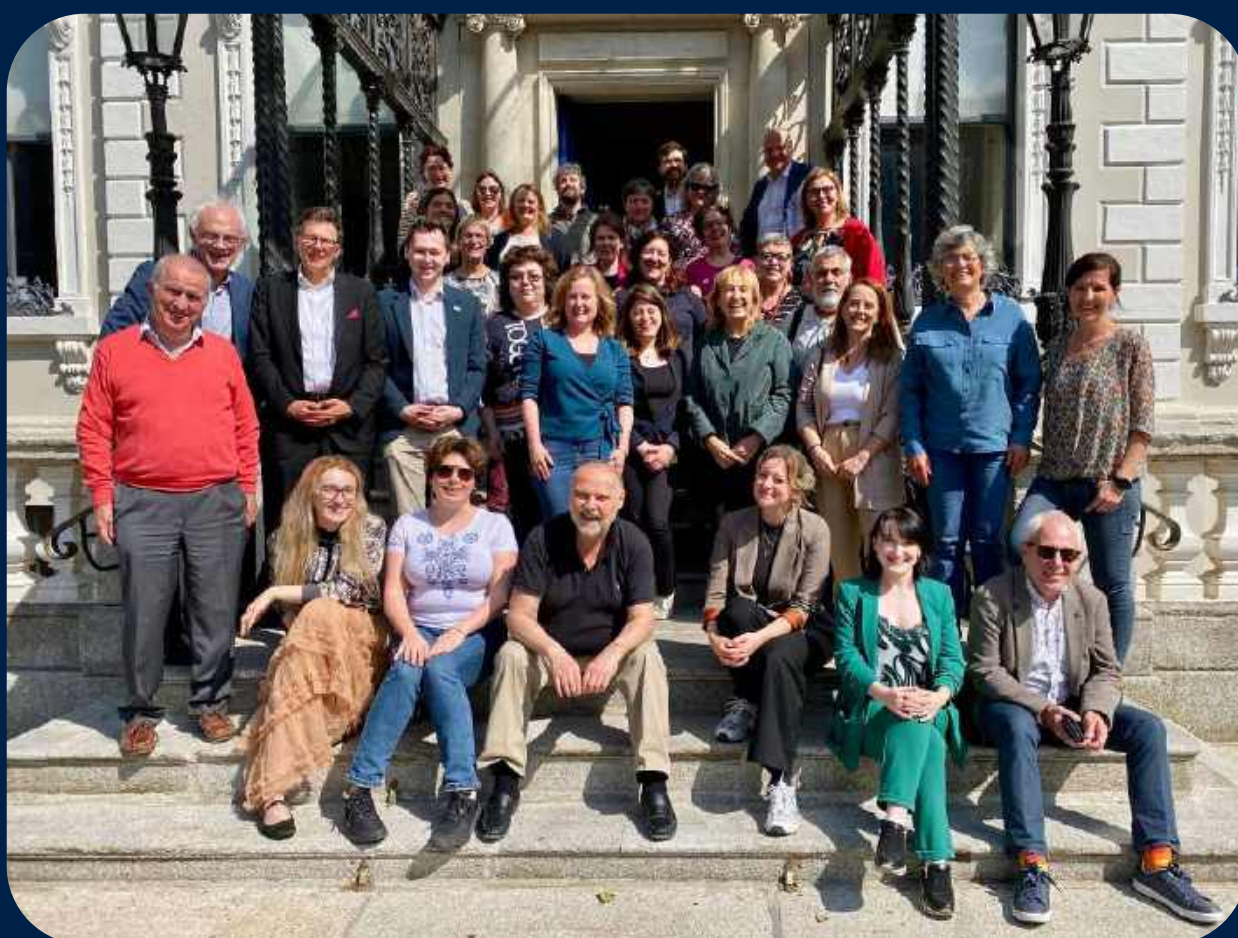
Autism-Europe members at our 2024 Annual General Meeting and meeting in Dublin, Ireland, May 10-12, 2024.