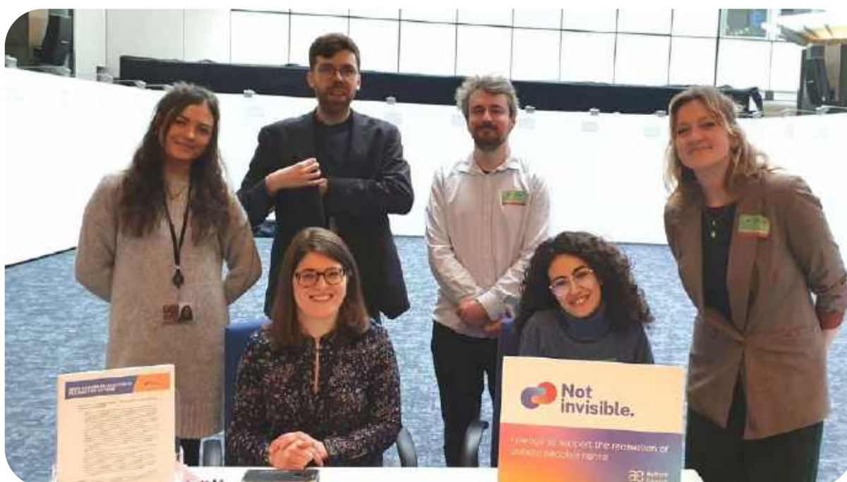
Autism-Europe team at the European Parliament on World Autism Awareness Day 2024, on April 2, 2024.

Cover picture(s): Pictures from the launch of the Proposal for the European Commission's Framework for Social Services of Excellence for Persons with Disabilities, ENIL on April 9th, 2024, WAAD 2024 and AE council of administration November 2024 in Brussels.